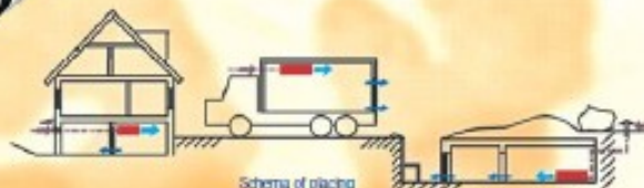
Schema of placing